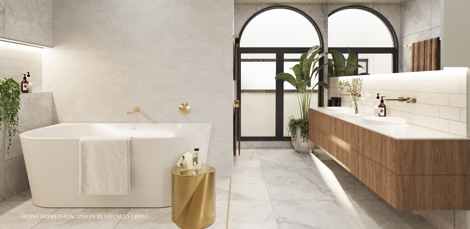
ARTIST IMPRESSION: UNION RESIDENCES LIVING