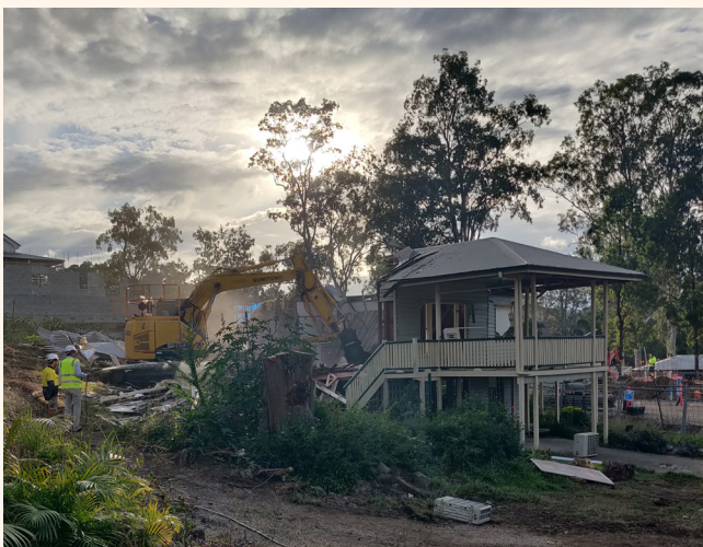
Image: Demolition at 29 Union Street, Taringa

Construction is underway, and Birch's own in-house construction team will be bringing the project to life with a construction schedule spanning just over 12 months.