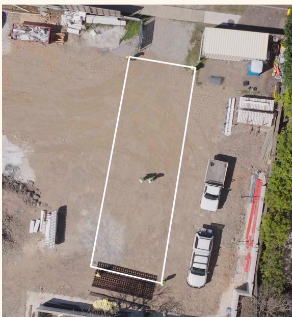
Photo: Approximate outline of Union Residence Lot 2

To truly grasp the sheer size of these residences, we invite you to visit our onsite display, where our sales team is ready to show you the scale and elegance of these unique properties.